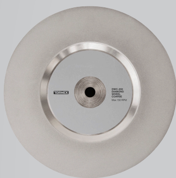
DWC-200 DIAMOND WHEEL COARSE 360 grit

The Tormek T-2 Pro Kitchen Knife Sharpener cannot only be used for your daily sharpening needs but for repairing damaged knives or if you want that extra polished finish. Combining different diamond wheels can make your sharpening faster and more suitable for your specific needs.